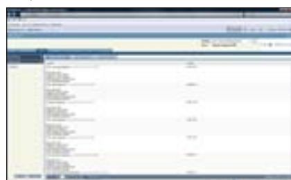
Lightning-fast search capabilities in the browser.

If you have a business application running on Windows, UNIX, System i or any other platform, integration with MultiArchive is a simple matter.