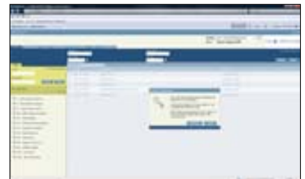
Complete check in check out functionality in the browser.

MultiArchive 7 also contains the following functionalities: