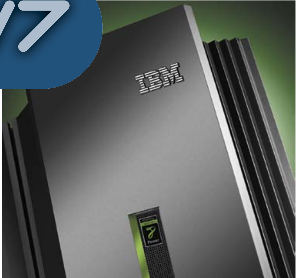
IBM and Multi-Support have teamed up to deliver a 25/7 Solution Server.